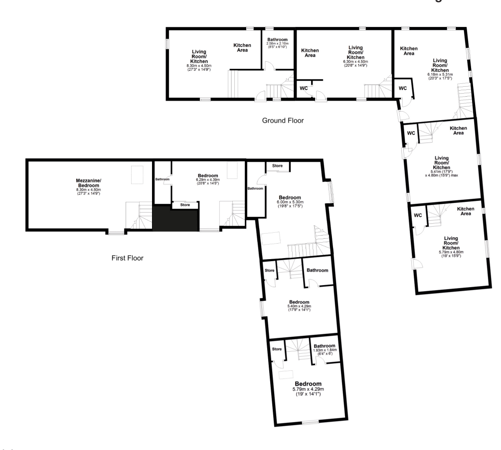
TR1422 | Sat Nav: House of Craigie, Craigie, KA1 5NA