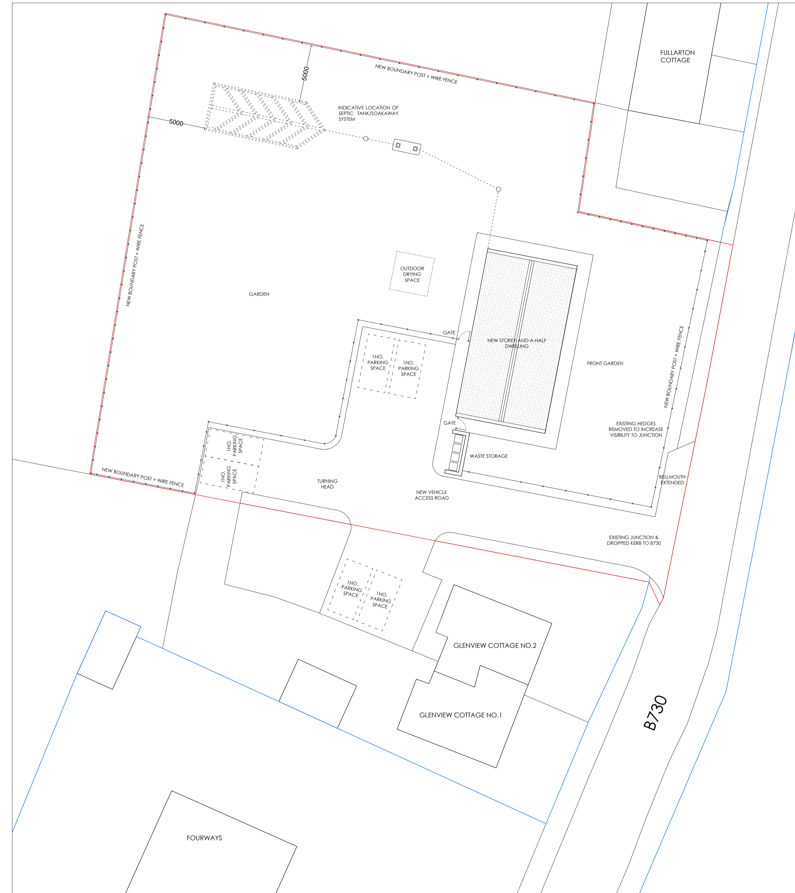
22033 - 01 - 02 SITE PLAN AS PROPOSED