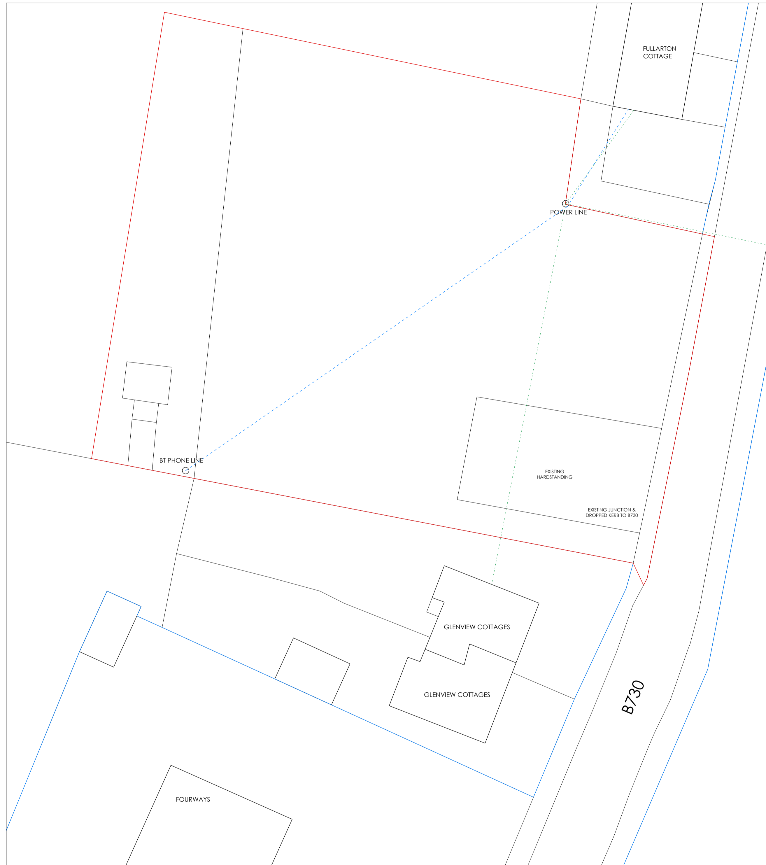
22033 - 01 - 01 SITE PLAN AS EXISTING

LAND OWNERSHIP BOUNDARY APPLICATION RED LINE BOUNDARY