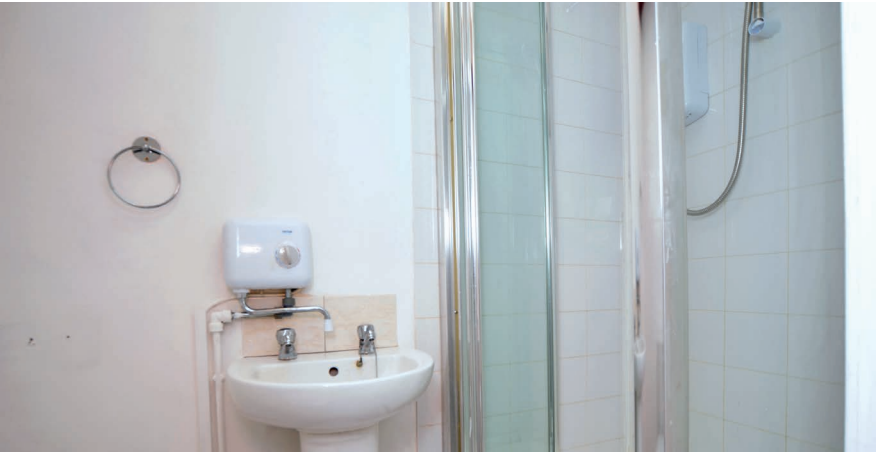
Ground Floor Approx. 21.0 sq. metres (226.2 sq. feet)