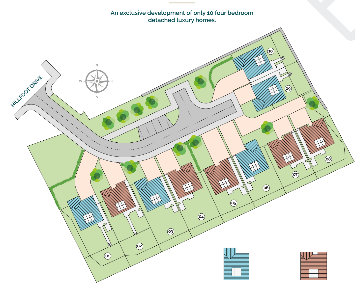
The Willow 4 Bedroom Detached Villa