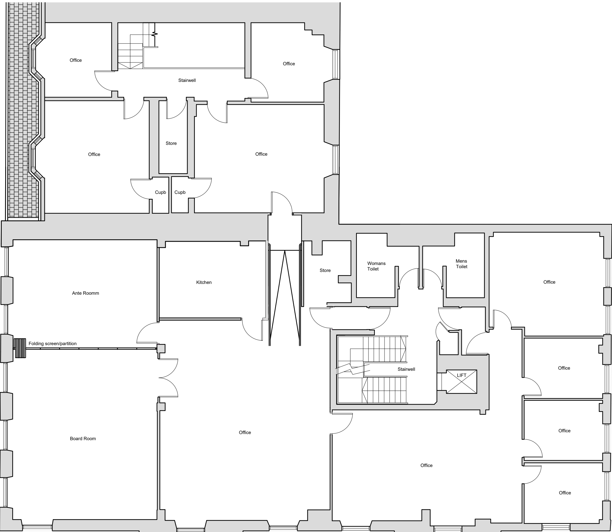
03 First + Second Floor Plan 1:100